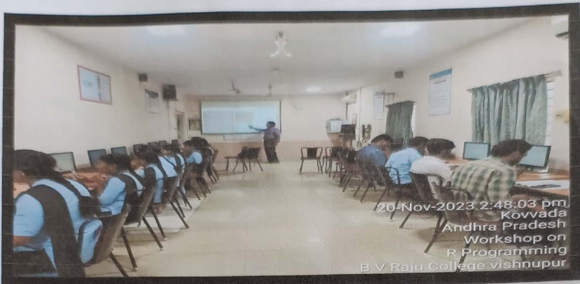
20-Nov-2023 2:48:03 pm Kovvada Andhra Pradesh Workshop on R Programming B V Raju College vishnupur